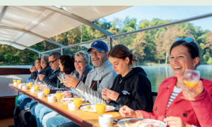
The pleasure: The «Brunch boat»