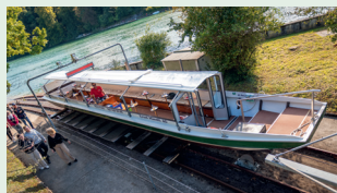
The adventure: The «Sluices tour to Eglisau»