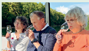
The experience: With «Ship & Wine»